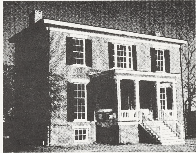
Elgin after renovation