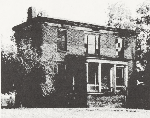
Elgin before renovation